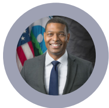
MICHAEL S. REGAN